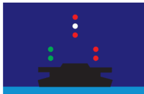
Safe side to pass (Green - Go)